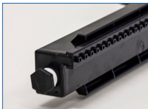
Molded, compact design with cleanouts for simple maintenance